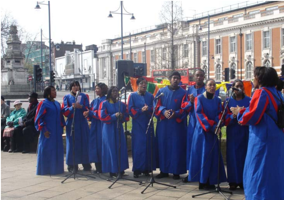
The Sozo House of Praise Gospel Choir started the formal proceedings at noon with their beautiful and joyful unaccompanied singing.