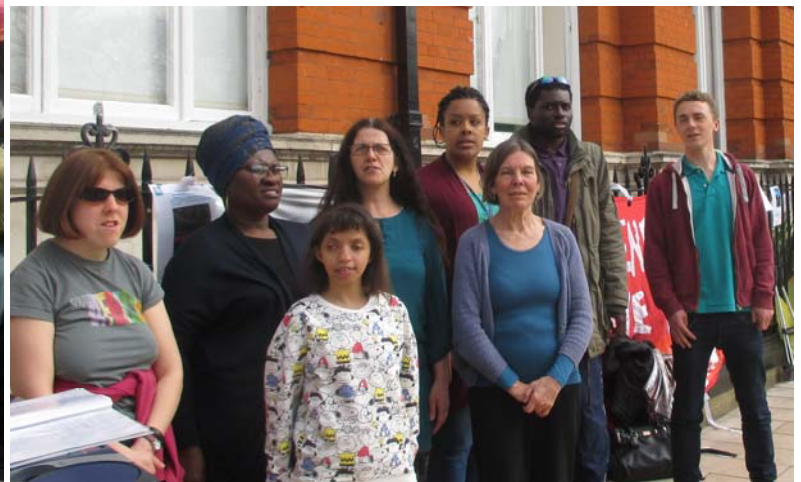
Music all around: In Windrush Square's sunshine with Joy of Sound or by the Library with Certitude Choir . An inclusive event!