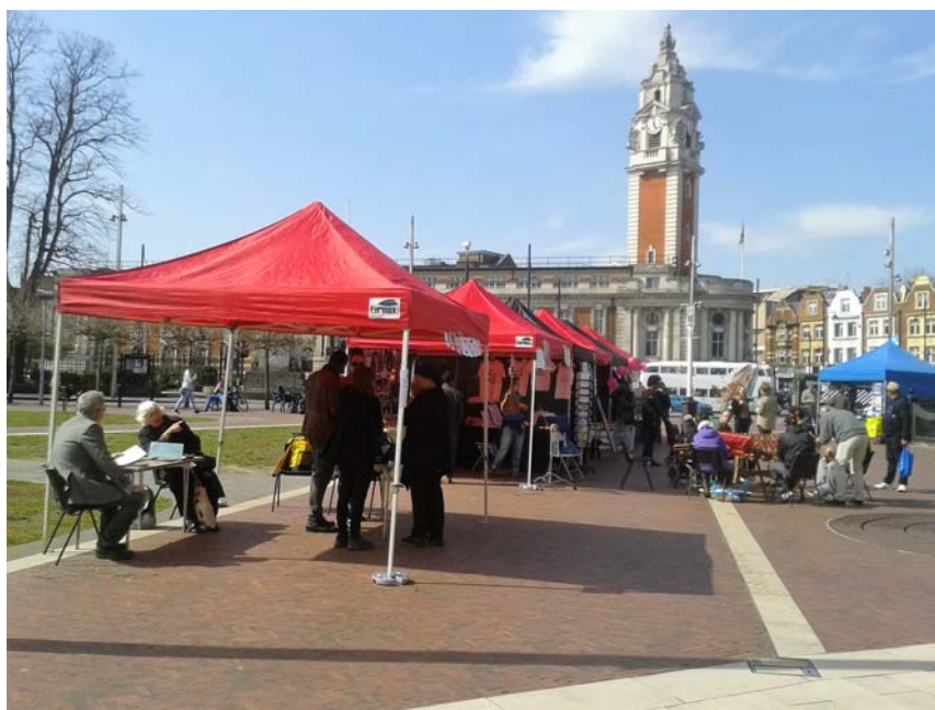
Windrush Square Community Day: in the foreground the Consultation Stall , through to the Friends of Windmill Gardens stall in the windmill's 200 th year.