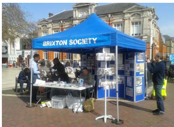
The organisers, FoWS and FoTLB are Sub-Committees of the Brixton Society .

Info and advice; sunshine, fun... and free ice-cream as a bonus! After a host of meetings called by concerned residents, and several press articles the people of Brixton enjoyed their Square, activities by local groups, and took time to find out more about local projects and facilities incl. Vida Walsh Centre, Age UK & Lambeth Healthwatch