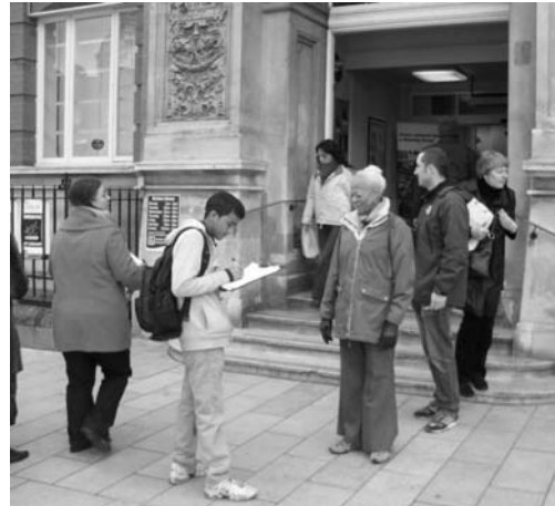
Friends of Tate Library collecting signatures of support outside the library during National Save Libraries Day, 5 th February.

We have participated in Brockwell Park's Management Advisory Committee, the Lambeth Police/ Community Consultative Group, Lambeth Local History Forum, Friends of Lambeth Libraries and Lambeth Parks Forum. We are now trying to re-establish a Brixton Forum to improve networking between local groups. We have been represented on the boards or committees of several local projects. The Friends of Windrush Square and the Friends of Tate Library currently operate as standing committees of the Brixton Society.