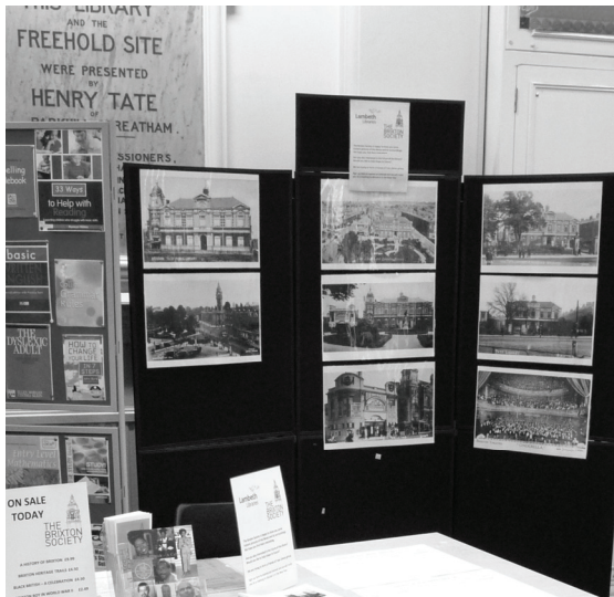
A display inside the library mounted by the Brixton Society in December 2009 aiming to recruit members to the Friends.

In background information to the work of the Commission the Council states that "low usage of Lambeth libraries has resulted in the highest cost per visit, combined with the lowest levels of user satisfaction, of any London borough". One of the aims of the review is to find ways of increasing the take up of library services.