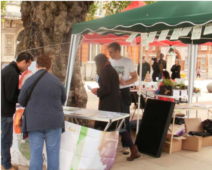
The Brixton Pound table with other exhibitors behind.

“We had a very successful event with over 50 new members. We shared our gazebo with Brixton Pound and sold our first Brixton Green shares with the purchasers using Brixton Pound mobile payments.”