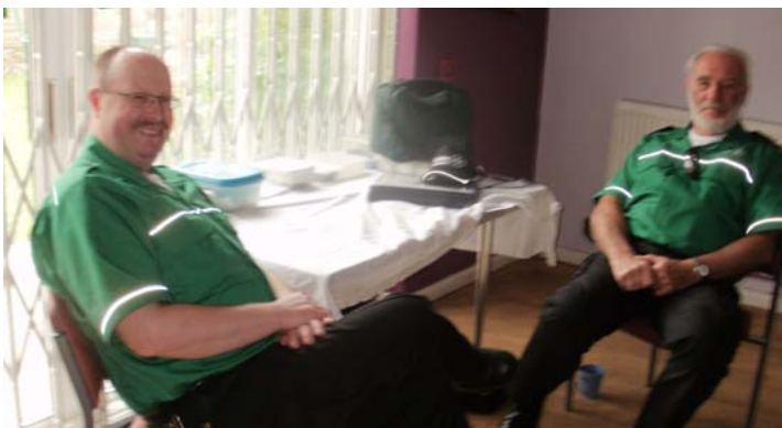
Our St John's Ambulance volunteers.

The Norwood & Brixton Foodbank provides emergency food and support to local people in crisis. The Brixton end is run from St. Paul's Church in Ferndale Road. Contact: mobile: 07538 888415 email: norwoodfoodbank@btinternet.com www.norwood.foodbank.org.uk