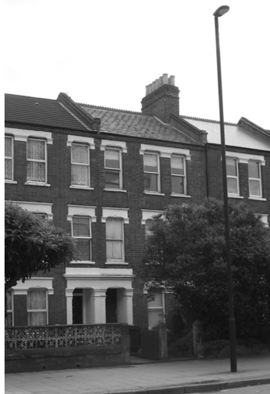
A recent photo of 133a Coldharbour Lane, the right-hand porch of the pair (BX-E-Jn14-03.jpg)

After this, the centre will be open on Tuesdays to Sundays from 10 am to 6pm. As with any archive, we suggest prior enquiries to help find material you are seeking. For more details see www.bcaheritage.org.uk