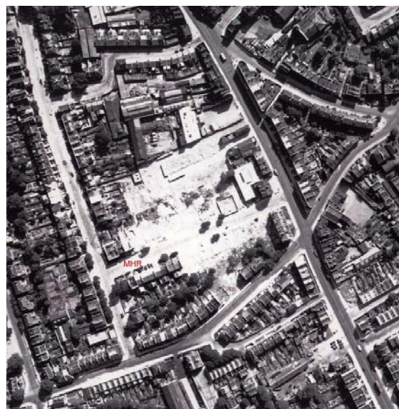
Manor House Road in August 1945, with Aytoun Road to the left and the Stockwell Green triangle to the right (south is at the top!)