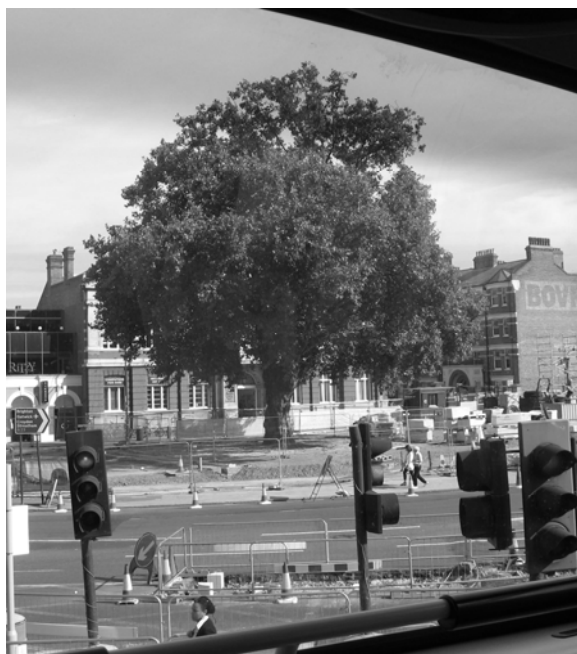
Let's do the show right here! The view from the Clapham omnibus on 24 th September.