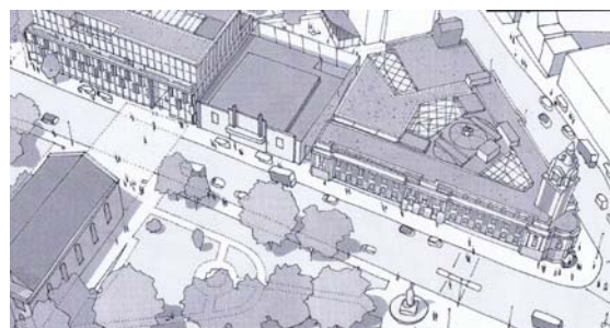
Aerial view of Kajima proposal for Town Hall – more designs are shown on page 3 inside...

Fast forward to 2013 and it's interesting to see how processes and priorities have changed. This time the competition is between just 3 developers, each with a team of architects and other advisers in tow, though we don't know if any others have fallen by the wayside. The requirements are more complex, involving several sites in addition to remodelling the Town Hall itself. These include nearby offices – 1-7 Town Hall Parade, Hambrook House, Iver House (the old Co-op store in Acre Lane) and Olive Morris House on Brixton Hill. Further afield, International House (behind the Recreation Centre) and the small Wanless Road depot near Loughborough Junction, are being offered to the winning developer for residential use. After moving key departments