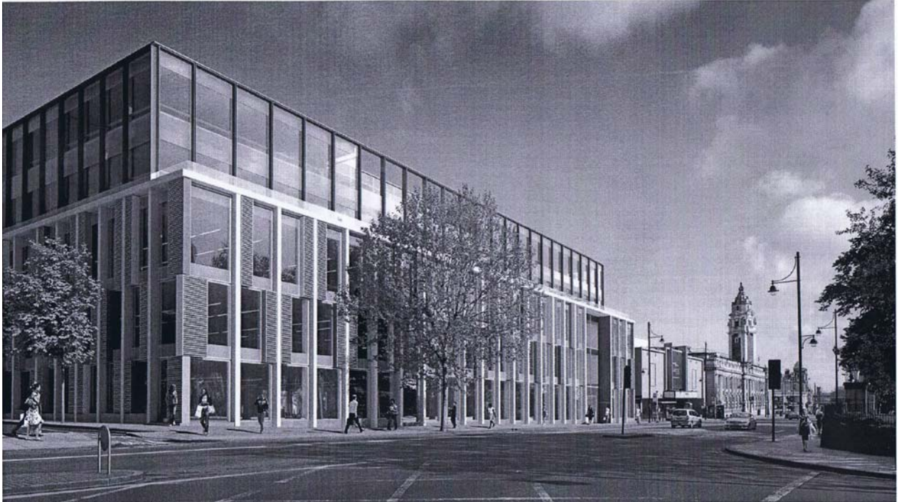
Kajima proposals for new Council offices replacing 1-7 Town Hall Parade, Brixton Hill