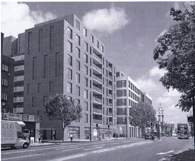
Muse proposals for replacing Hambrook House and Town Hall Parade, Brixton Hill (above)