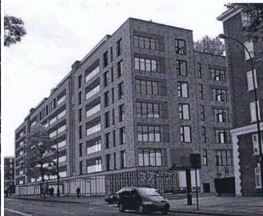
Muse replacement for Olive Morris House Below: views of United House proposals