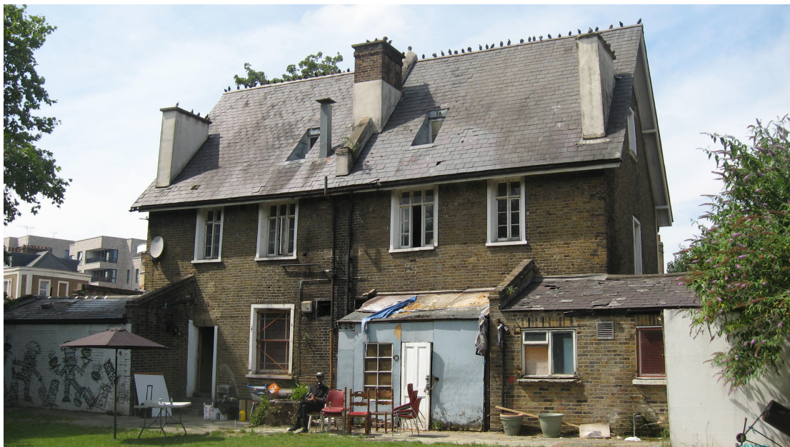
View from rear garden, 23.7.21 AP/pic/img.9924.jpg